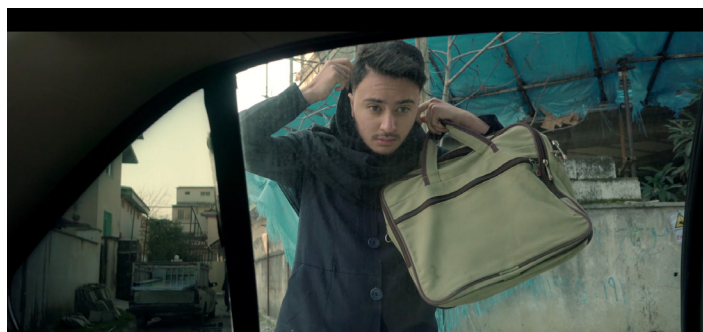
"THIS IS NOT ME"