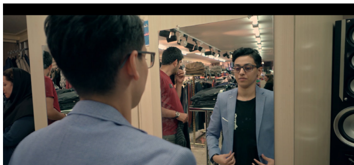
"THIS IS NOT ME"