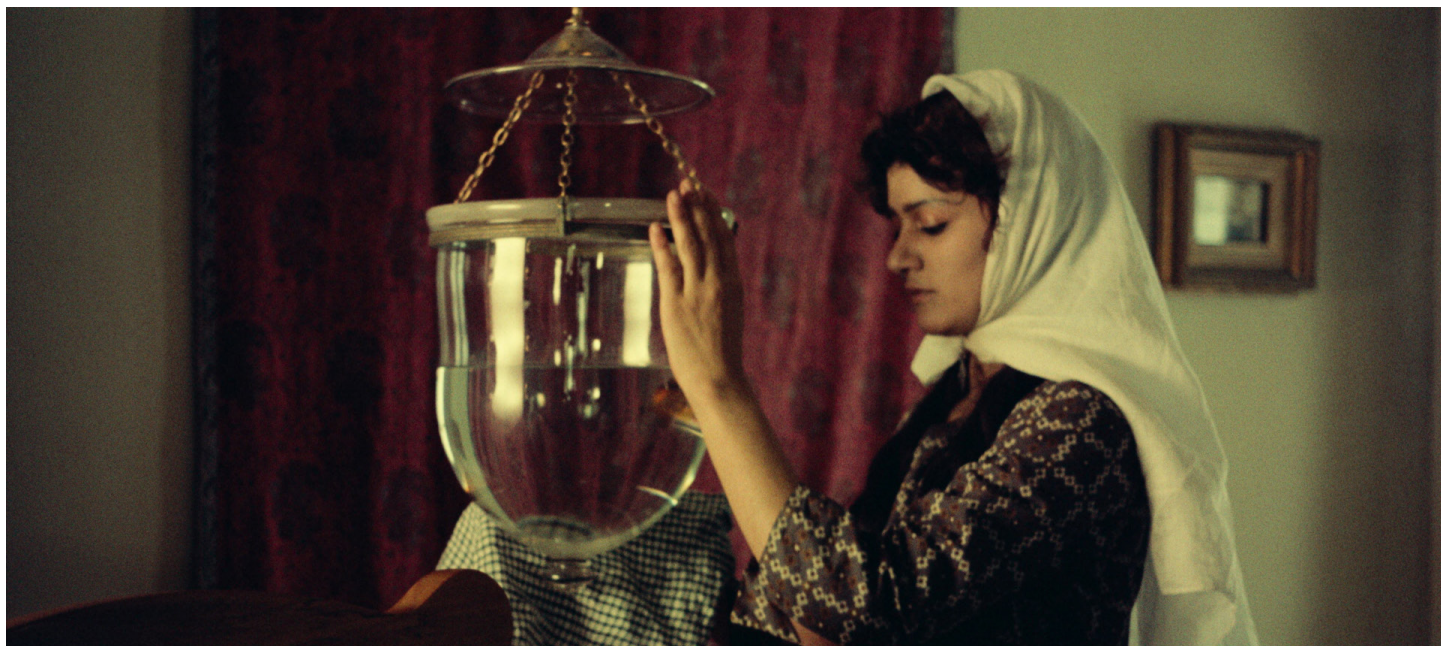
"CHESS OF THE WIND"